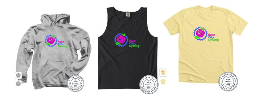
Club apparel store